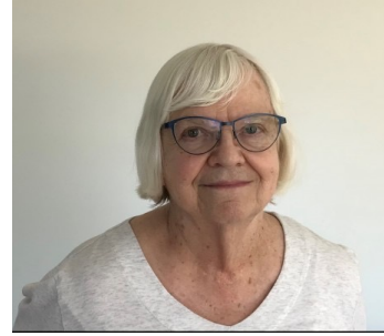
Alyce Bassoff Movies